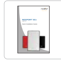
Quick Installation Guide