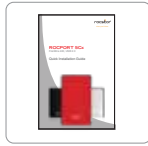
Quick Installation Guide