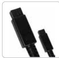
FireWire 800 Cable