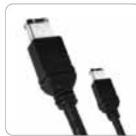
FireWire 400 Cable