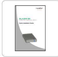
Quick Installation Guide