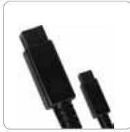
FireWire 800 (9 to 9 pin) Cable