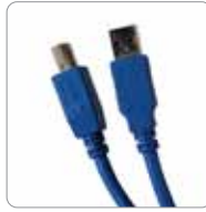
USB 3 Cable