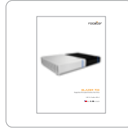
Quick Installation Guide