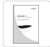
Quick Installation Guide