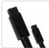
FireWire 800 Cable